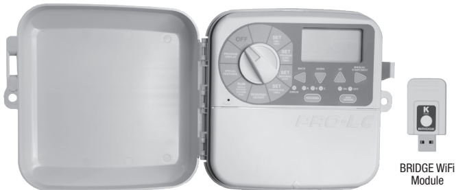
PRO-LC WiFi Controller